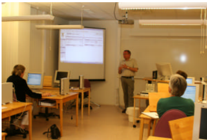
civil servants at Uddevalla receive instruction how to handle the LEX system