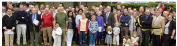
new inhabitants of Harelbeke in 2002

In the report, the jury mentioned the collaboration between different agencies on a local level, the citizen centred perspective and the willingness to learn and enhance.