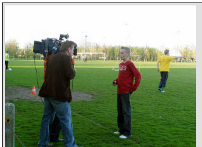
A national Dutch television crew interviews a young man why his village is a good place to live in

But, they also advocated a direct dialogue with their politicians and emphasized the importance of an active policy to change the image of Zwaagwesteinde in a positive way.