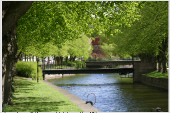
the river Bäve at Uddevalla (S)

an automated document management system for public administrations. LEX provides citizens with information, it supports e-services and (political) decision making 24/7.