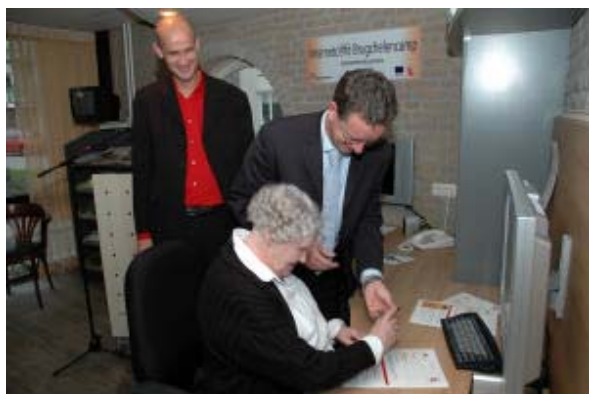
internet access for the elderly

evoice aims to increase public influence and citizens' participation in political processes