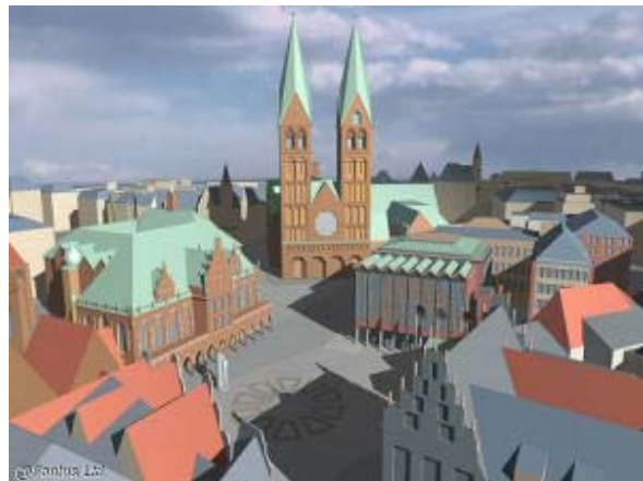
The Markt at Bremen in a virtual world

are chatting with the Bremen citizens about bigger and smaller subjects chosen by the chatters.